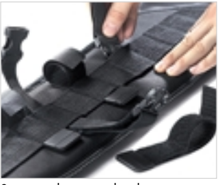
Straps can be removed and custom-positioned to better match the size